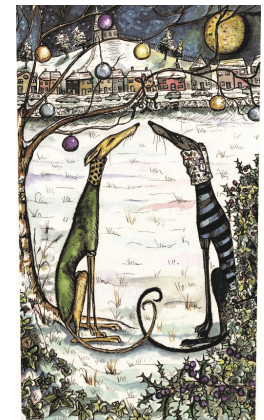
BAROSSA MERLOT CABERNET SAUVIGNON CABERNET FRANC