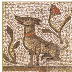
SORTER Pinto Gris

King Arthur's dog Cavall was said to have left his pawprint in a stone while he and Arthur were hunting the great Boar in Wales. Arthur honoured his canine friend by erecting a monument and placing the paw print stone on top. People would come and take the stone as a souvenir but the next day it would return to its rightful position, just as a dog will always return to its master.