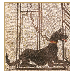
ANUBIS Cabernet Sauvignon