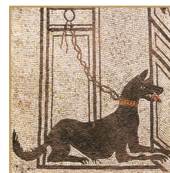
ANUBIS Cabernet Sauvignon