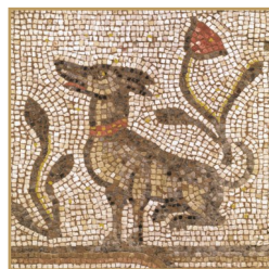
SORTER Pinto Gris

Greek warrior Alexander the Great (356-323 BC) used greyhounds during his military campaigns. One faithful battle, his favourite greyhound Peritas fought a war elephant. Alexander was so impressed at the faithfulness and bravery of Peritas that he ordered a state funeral for his friend, named a city after him and had a statue erected in his honour in the city square.